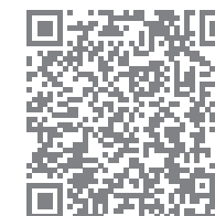
PUDU SH1 Software User Manual